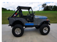
1978 jeep cj5 renegade 304 awesome (US $14,500.00)