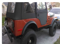
1977 jeep cj5 base sport utility 2-door 4.2l