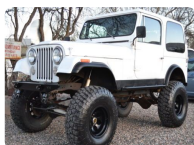
1979 jeep cj7 wrangler, 4x4, spoa, manual, lift, new km2s, warn bumpers (US $6,800.00)