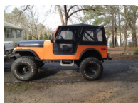
1978 jeep cj7 v8 (US $8,500.00)