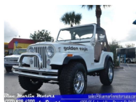
Cj5 cj-5 golden eagle inline 6 4x4 4 speed manual trans vintage cj jeep