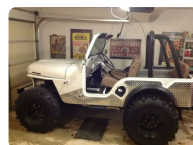
1965 jeep cj5 base 2.2l tuxedo park